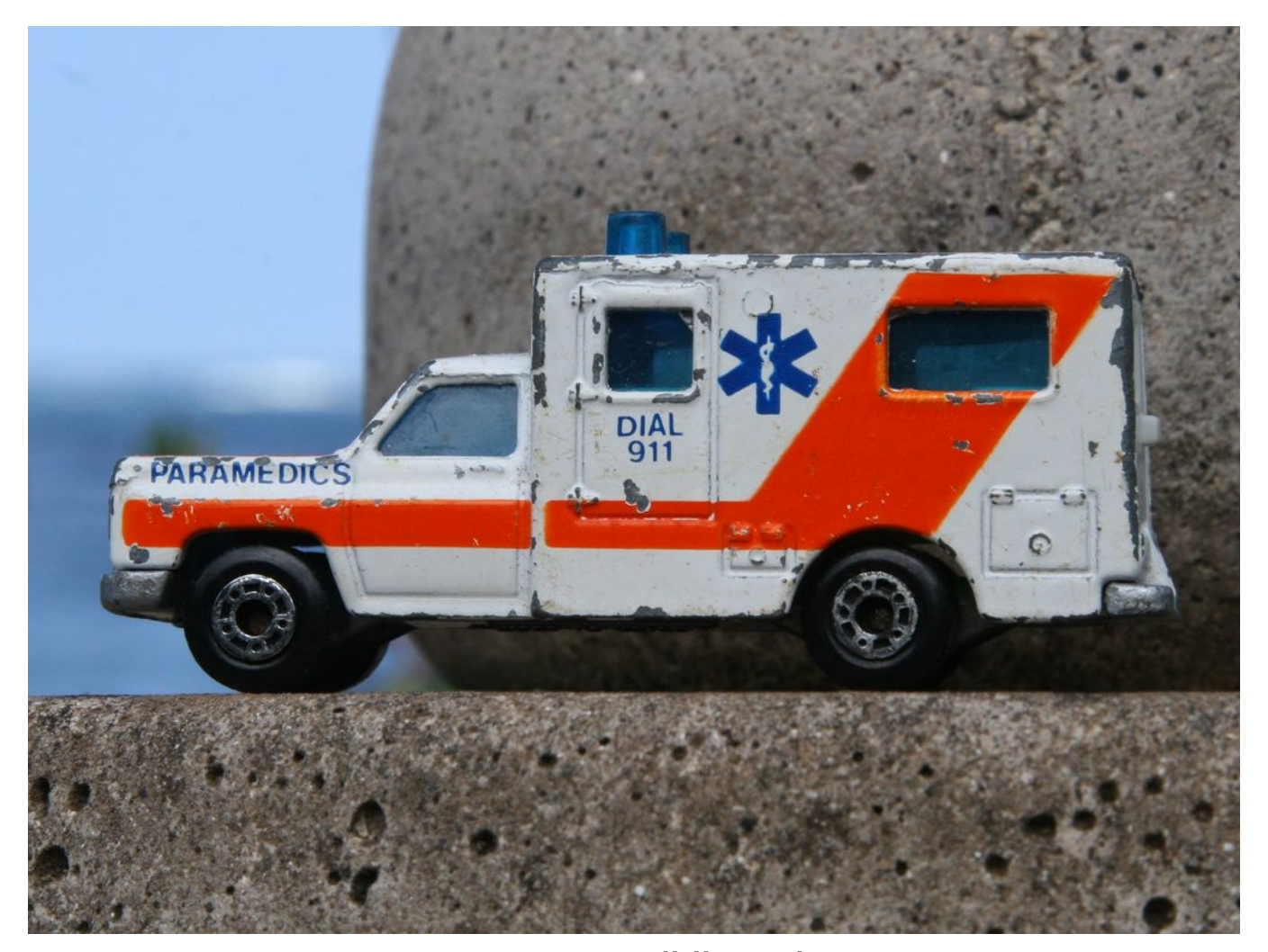
CC BY puuikibeach 1:6 1:33 - https://www.rainn.org/statistics/scope-problem